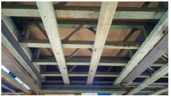
Figure 3: Floor trusses fitted in between steel beams