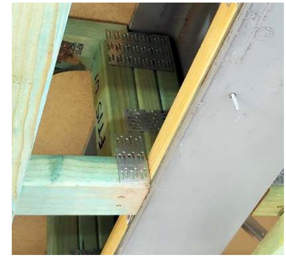
Figure 1: Matching floor truss end details with steel work Courtesy of Pro Truss & WA Country Builders

In general, if we ensure consistency between the different component systems in a project, it will always deliver a reliable result through ease of installation.