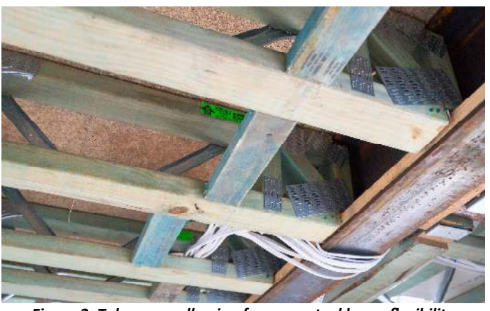
Figure 2: Tolerances allowing for some steel beam flexibility