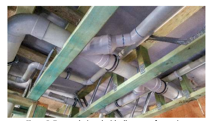
Figure 5: Trusses designed with allowances for services

If the above considerations are adhered to during the design process, the strengths of a timber webbed truss or Posi-Strut floor system, as a well-integrated, compliant and efficient method of construction, can be fully realised. Appreciating its importance and giving it adequate time during this critical phase in the construction process, hence "sharpening your axe", are vital to the success of any project.