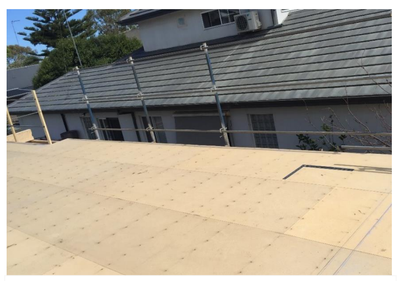
It is the builder's responsibility to provide the fall protection for the building site whether you include fall protection for window and door openings or not.